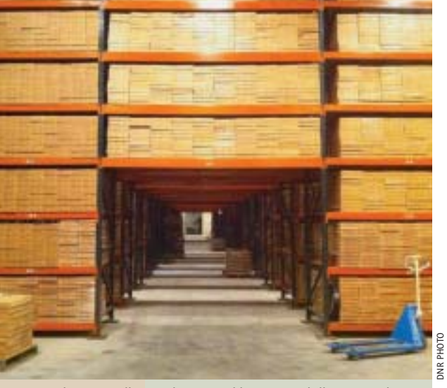
The DNR Drill Core Library in Hibbing stores drill-core samples from mineral exploration dating back to the early 1900s.