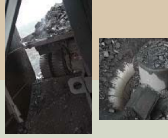
A mammoth truck hauls 240 tons of ore to the crusher (above left and right), which breaks it into 8-inch and smaller chunks. A fine crusher further reduces chunks to half an inch and smaller.