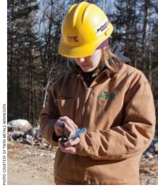
A geologist with Twin Metals uses a compass to check the alignment of the drill rig to the exploration site.

The DNR Lands and Minerals Division oversees exploration and inventory of the state's minerals. The DNR and the Pollution Control Agency are charged with regulating mining projects and overseeing permit compliance. Both agencies will monitor development of the mines, processing plants, and tailings basins. The