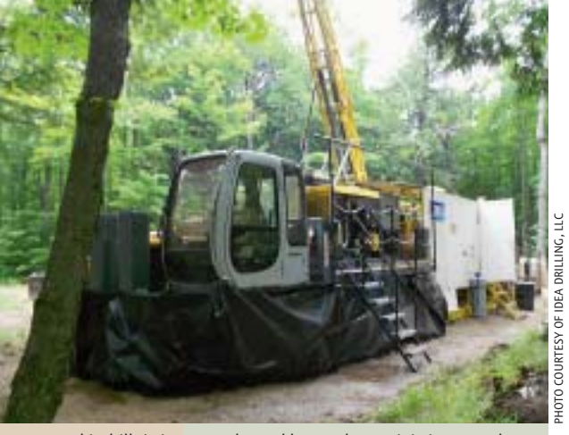
This drill rig is mounted on rubber tracks to minimize ground pressure and soil compaction.