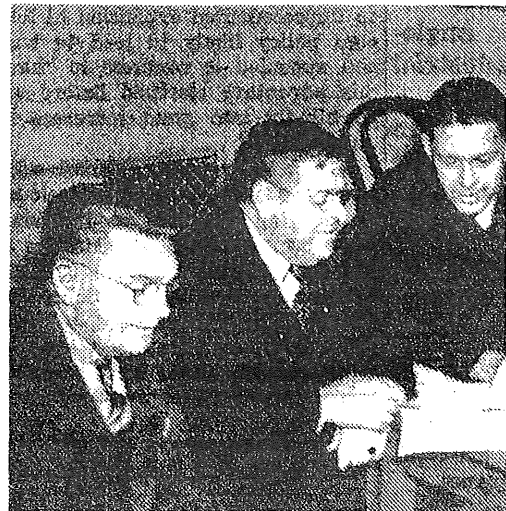
SOME OF THE V