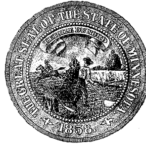
THE present great seal of the state