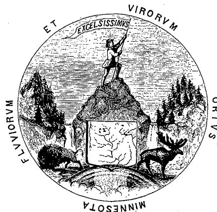
NEILL'S design for a state seal

The story of its subsequent adventures can be traced in a series of letters recently discovered in the state archives and in the