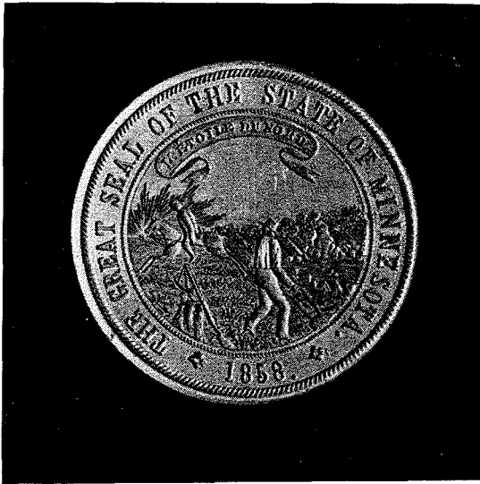
THE original die of the great seal, actual size