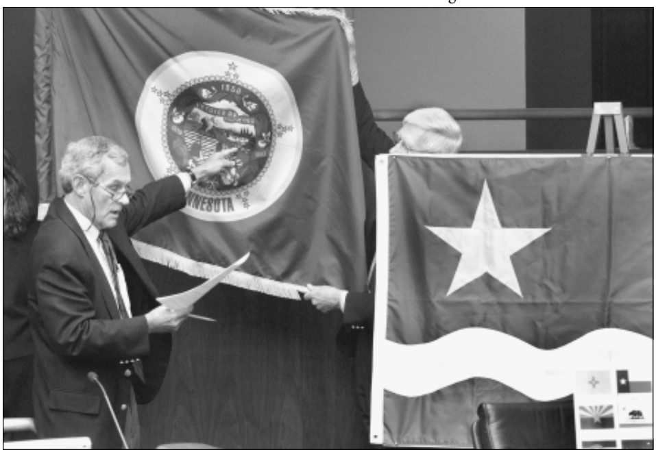
Rep. Ron Erhardt, left , describes the detail in the Minnesota state flag to illustrate why a new design is needed during the Feb. 27 meeting of the House Governmental Operations and Veterans Affairs Committee. Sen. Edward Oliver, right , also testified in support of the bill that would establish a state flag design task force. Displayed at the committee was one possible new flag design.