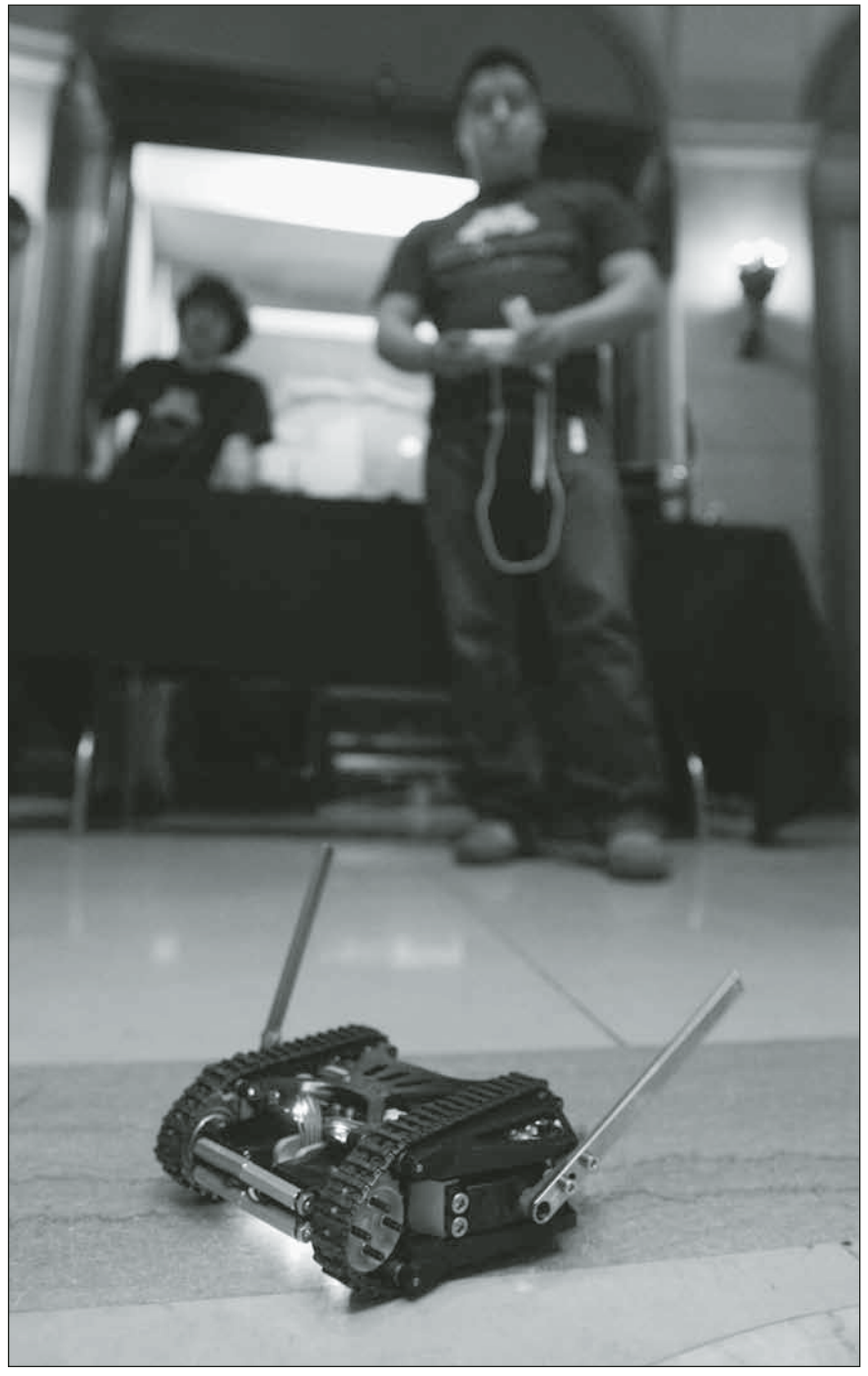
DUOTO DV DAIII DATTACIJA