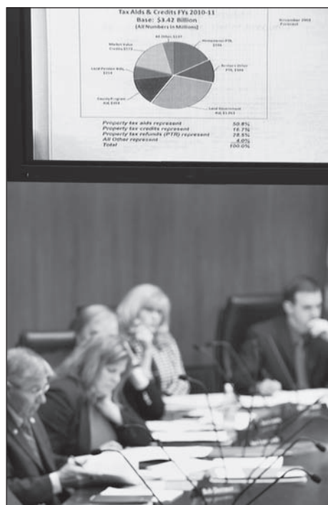
House Property and Local Sales Tax Division members receive an overview of the tax aids and credits to cities during a Jan. 7 meeting.

"We have a huge task. We need to be as fair as we can, which is all in the eye of the beholder. When people don't receive things equally it's so hard to take things away." The public is going to have trouble understanding why things are playing out the way they are, she said. If LGA is cut, then questions come as to why someone else didn't get a cut. "We need to decide how we define 'need.' Who needs it the most is going to be an incredible task. It's going to be rough. It's going to be very painful."