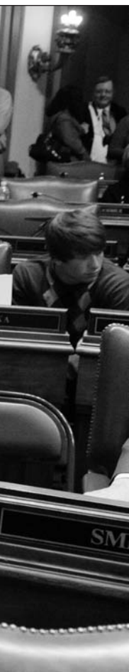
the 2009 legislative