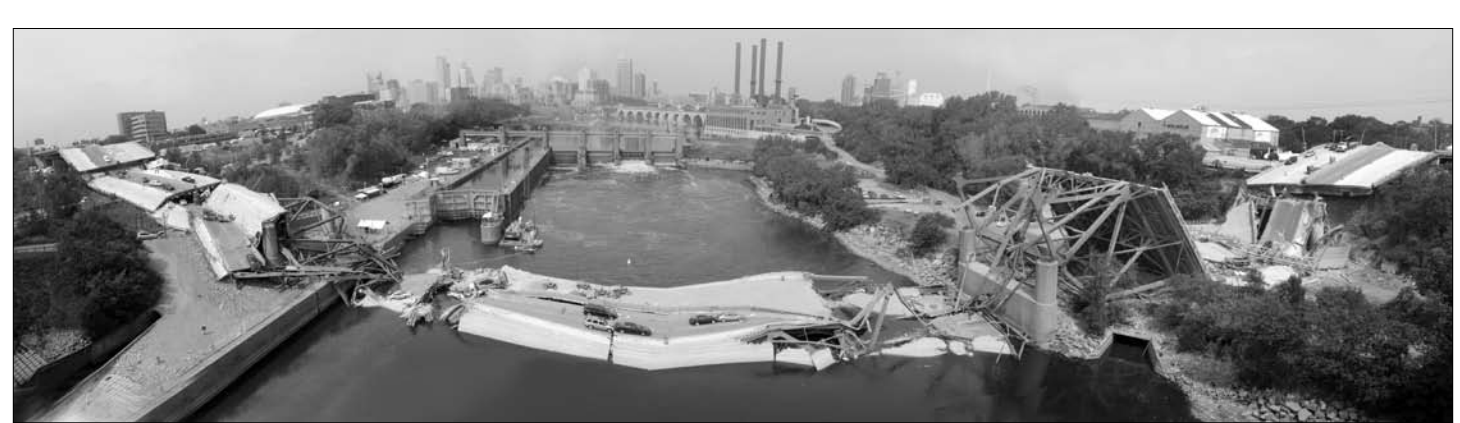
STITCHED PHOTO ILLUSTRATION BY ANDREW VONBANK