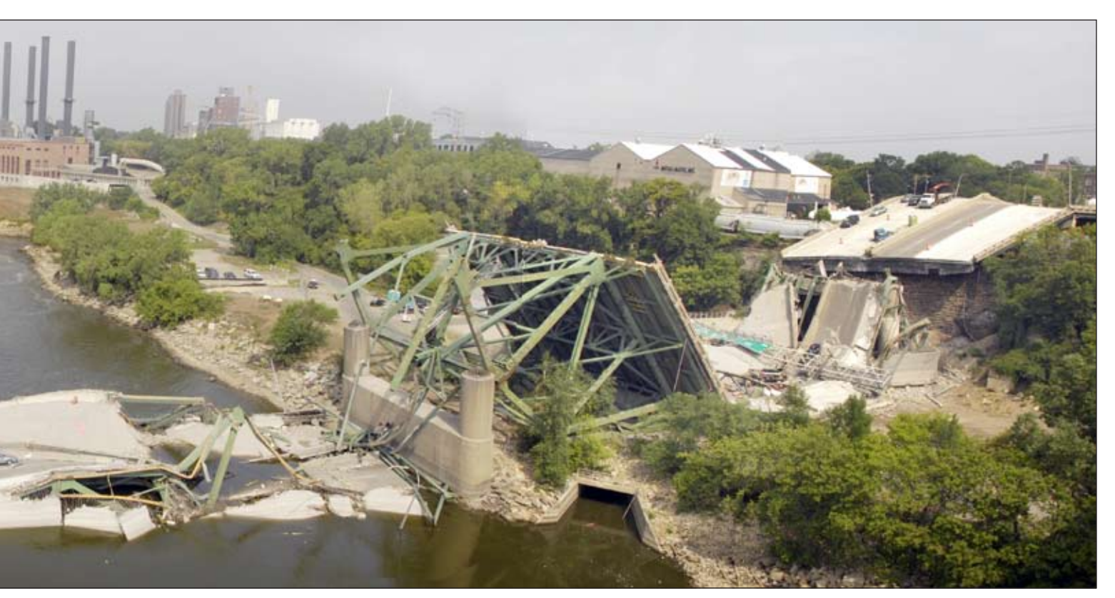
STITCHED PHOTO ILLUSTRATION BY ANDREW VONBANK

of 2008. However, some legislators are concerned the reconstruction plan is too fast and does not address all possible alternatives, including room for light rail.