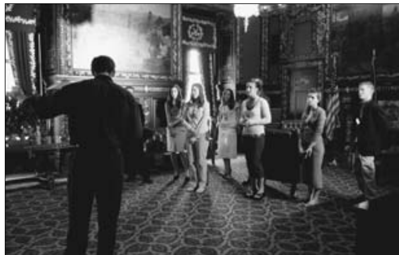
A member of the Minnesota Historical Society meets the pages in the governor's office.