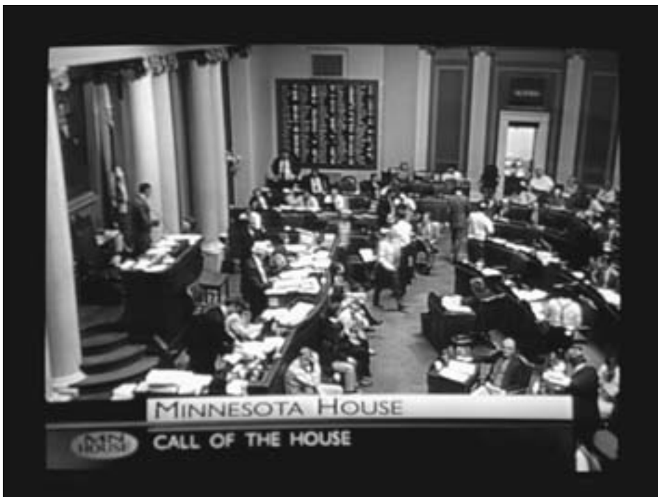
House Television Services provides coverage of action on the House floor and selected committee hearings on Channel 17 in the Twin Cities and local cable systems throughout the state.