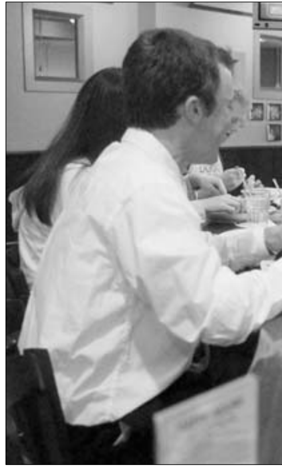
The pages have dinner at KFAN The Restaurant in Roseville.