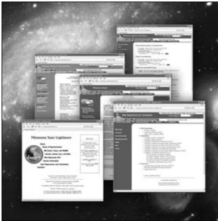
Through the Legislature's Web site, the public can access information including bill descriptions and status, committee meeting schedules and agendas, and weekly publications of both the House and Senate.

One of the more popular options is the bill tracker. From the House and Senate pages, users can read any bill and track its status through