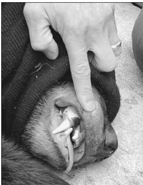
Rep. Greg Blaine examines a bear's teeth during a black bear den visit at Camp Ripley. The camp, which is near Little Falls, is in Blaine's district.

"Of course that sounds good but nobody knew what that meant," he said. The first step, he said, was developing an accurate inventory of the plant and animal species on the base. The inventory served as the foundation for