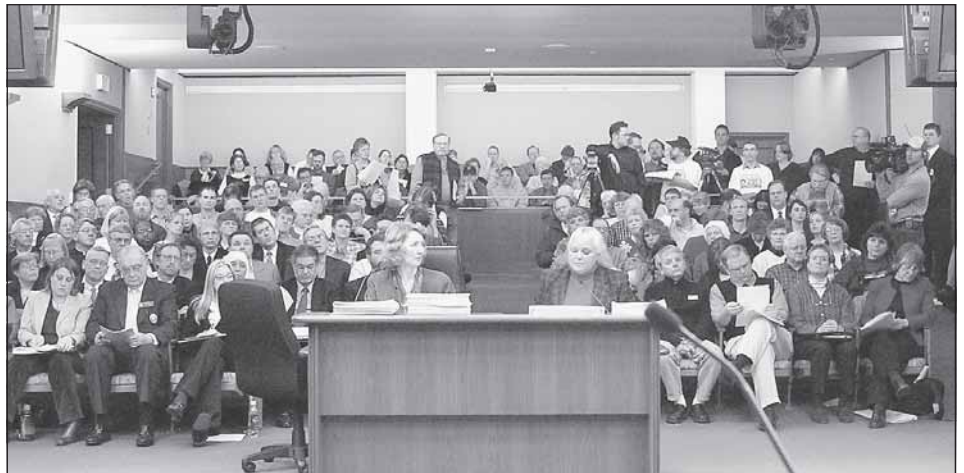
Before a packed committee room, the House Civil Law Committee approved a bill March 9 proposing a constitutional amendment that, if approved at the polls in November, would limit the definition of marriage to that between a man and a woman.

The bill's Senate companion (SF2715), sponsored by Sen. Michele Bachmann (R-Stillwater), awaits committee action.