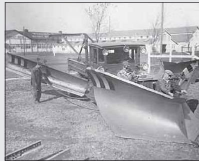
A snowplow at the State Highway Department in 1935.