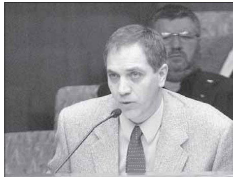
Grand Marais Creek Subwatershed Governor's Clean Water Cabinet Pilot Project

The program is designed to help local government units, such as cities, counties, watershed districts, and lake improvement districts, reduce or prevent flood damages by provid-