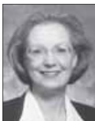
Rep. Elaine Harder R-Jackson District 22B Terms: 5