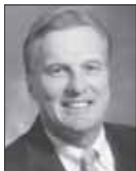
Rep. Len Biernat DFL-Mpls District 59A Terms: 4