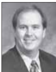
Rep. Carl Jacobson R-Vadnais Heights District 54B Terms: 2