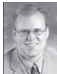
Rep. Doug Stang R-Cold Spring District 14B Terms: 4