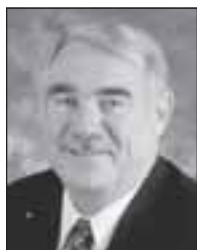
Rep. Dick Borrell R-Waverly District 19B Terms: 1