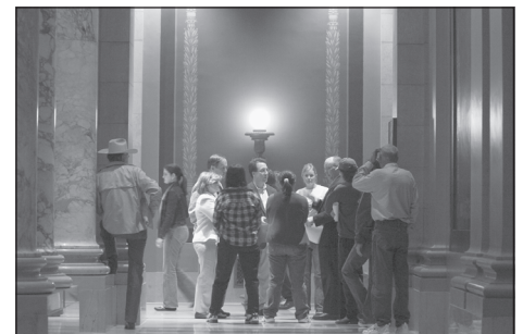
Legislators and people interested in an exotic animals bill work in a hallway outside the House Chamber toward an agreement. The bill was passed in the early-morning hours of May 16 and awaits the governor's signature.

One provision of the bill would set tagging requirements for nets used in non-infested waters by commercial anglers who fish both infested and non-infested waters. However, under the bill, there is an exception for waters infested solely with Eurasian water milfoil. Nets used for commercial fishing and turtle, frog, or crayfish harvesting in milfoil-infested waters could be