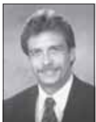
Rep. Dale Walz R-Brainerd District 12B Terms: 2