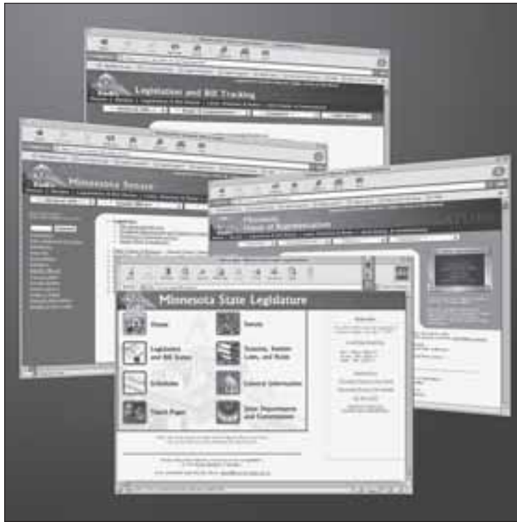
Through the Legislature's Web site, the public can access information including bill descriptions and status, committee meeting schedules and agendas, and weekly publications of both the House and Senate.

One of the more popular options is the bill tracker. From the House and Senate pages, users can read any bill and track its status through the legislative process. For those not