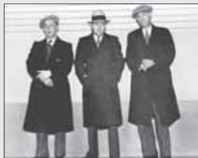
Suspects in a 1935 police line-up.

Minnesota/Mayo Clinic biotech research facility;