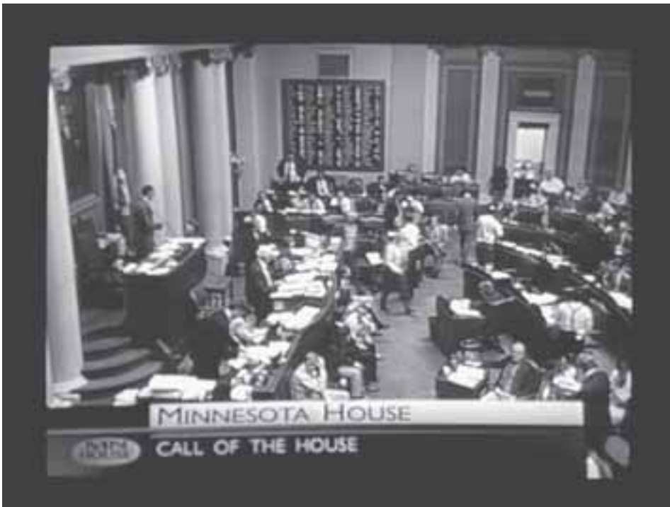
House Public Information Services provides coverage of action on the House floor and selected committee hearings on Channel 17 in the Twin Cities and local cable systems throughout the state.