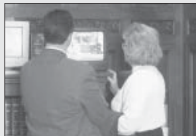
House staff members watch the broadcast from the House floor in the House retiring room.