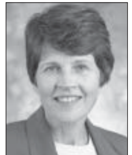
Rep. Barb Sykora