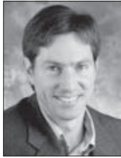
Rep. Kent Eken