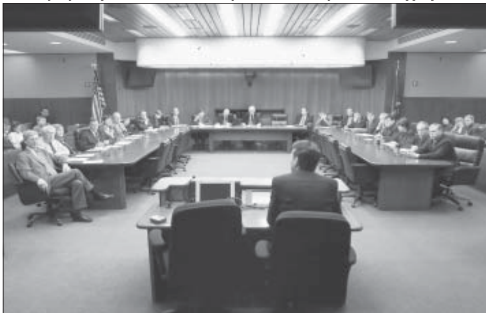
Gov. Tim Pawlenty tells members of the Legislative Advisory Commission Feb. 5 that if an agreement to balance the fiscal year 2003 budget is not reached by the next day he would begin trimming appropriations to balance the budget.