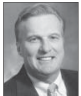
Rep. Len Biernat