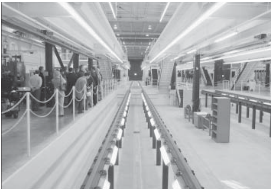
The House Transportation Finance Committee tours the maintenance operations center for the Hiawatha Light-Rail Transit project Feb. 4. Scheduled to begin operation in April 2004, the system will travel nearly 12 miles between downtown Minneapolis and the Mall of America.

system, will purchase a total of 26 cars, and each train will operate with two cars. In addition, two cars will be used when other cars need to be maintained.