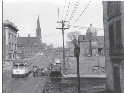
Wabasha Street in St. Paul, looking north from 13th Street, toward the State Capitol, right, in 1949. On the left is the spire of Trinity Evangelical Lutheran Church, torn down in 1952.

the east and spired churches, handsomely built hotels, and businesses to the west had become part of a poor, rundown neighborhood of mostly dilapidated or boarded up buildings. Legislative approval in the early 1950s allowed for the neighborhood and Capitol complex to begin to take on the more distinguished look that Gilbert had in mind.