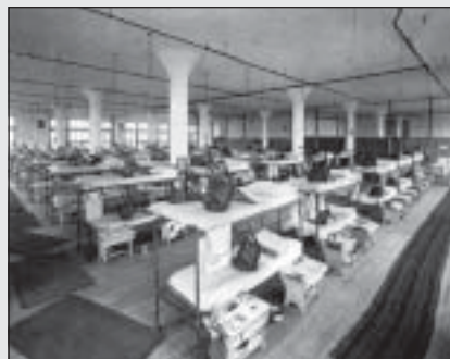
The dormitory above the twine factory at Stillwater Prison in 1910.