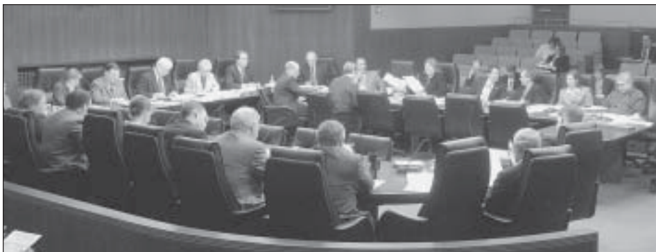
Members of the House Taxes Committee debate the public finance bill during a May 12 meeting. The bill would allow local governments to sell bonds for certain public improvement projects.

the House floor. It would create a special taxing district in southern St. Louis County for the Chris Jensen Nursing Home in Duluth. The original bill called for requiring St. Louis County to levy an equal amount to all publicly owned nursing homes in the county — not just to those owned by the county.