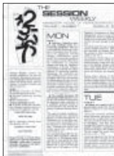
Session Weekly Vol. 1, No. 1 in 1984.

But we may need your help. Due to proposed budget cuts in the House of Representatives, the House may not be able to provide funding for