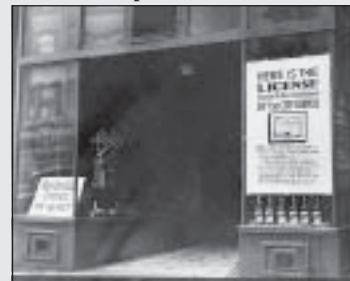
The window of Perley McBride's on-sale liquor establishment advertising a dispute with the city of Minneapolis over liquor license in 1935.