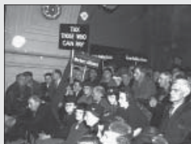
Members of The People's Lobby express their opinions from the House Gallery in 1937.