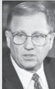
Gov. Arne Carlson

The state's economic situation improved and budgets commencing in 1994 contained healthy surpluses.