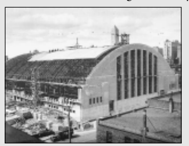
The Minneapolis Armory, shown here during construction in 1935.

tel, and even a sound stage. But it is currently being used as a parking facility. Even modest use is better than allowing it to sit vacant and deteriorate, Gimmestad said. Sometimes environmental rights petitioners claim the integrity of a historical site is at stake, even without the threat