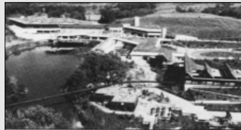
The Minnesota Zoological Garden pictured in 1992.