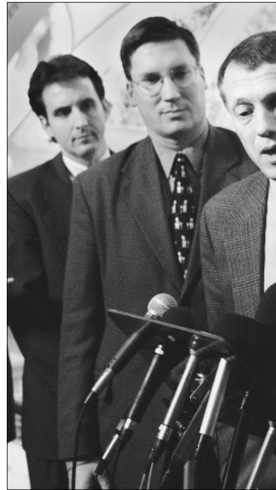
House Speaker Steve Sviggum, right, holds a copy of the bill, the governor during a May 15 press conference in the House center, sponsor of the bill, and Majority Leader Tim Pawlenty.

The Senate language removes the requirement that the name of a physician who would perform an abortion must be revealed before