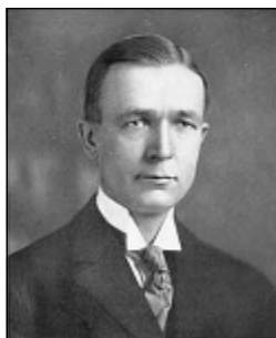
Gov. Adolph O. Eberhart signed the law abolishing the death penalty.

In 1877, Gov. John Pillsbury called for a repeal of the law, but the Legislature didn't act on the issue until 1883, when it passed a bill that mandated the death penalty for first-