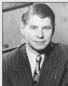
Gov. Orville Freeman

Gov. Orville Freeman was at the helm of the state at the time, and no doubt felt the encroaching turbulence of the 1960s. He convened a Committee on Ethics in Government in 1957. Two years later, that committee published Ethics in Government: A Report by the Minnesota Governor's Committee on Ethics in Government to Governor Orville L. Freeman .