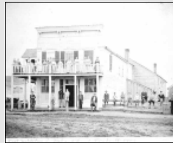
The first institution for the deaf at Faribault in 1863.