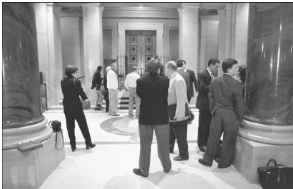
The more than 1,400 registered lobbyists who work the halls of state government are governed by the state’s Campaign Finance & Public Disclosure Board.

Olson said officials in other states often ask about the strict gift ban. They don’t under-