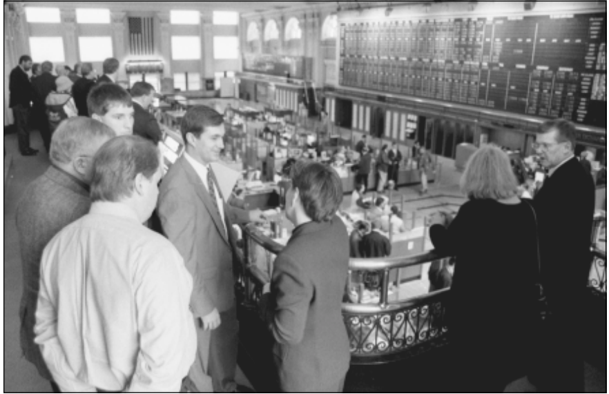
Members of the House Agriculture Policy Committee take a look at a lively trading pit during a Jan. 27 tour of the Minneapolis Grain Exchange.