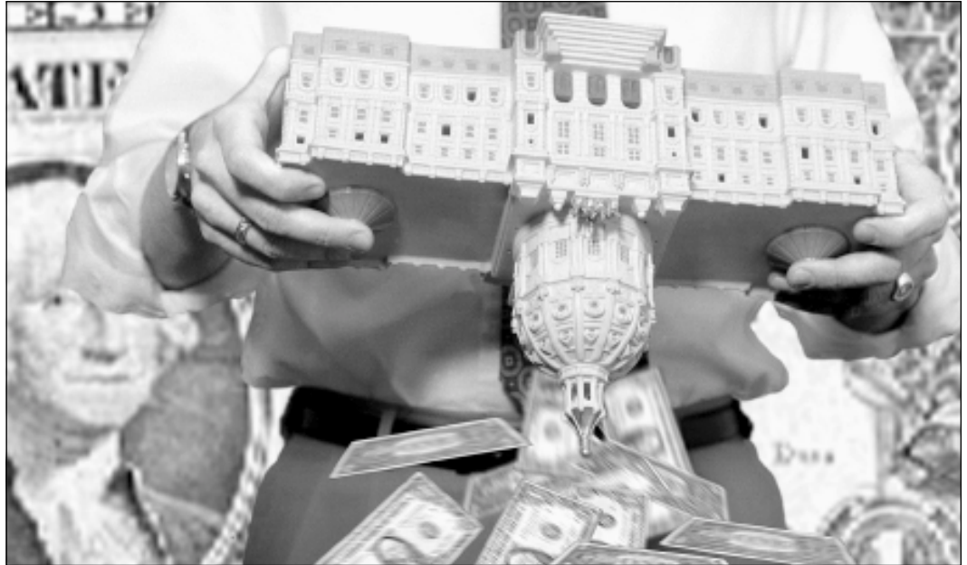
Tax bills being debated in the House would send money back to Minnesotans. One plan would provide an income tax rebate, and another proposal would send money to farmers.

The average taxpayer would receive a $575 check, according to statistics supplied by Minnesota Department of Revenue.