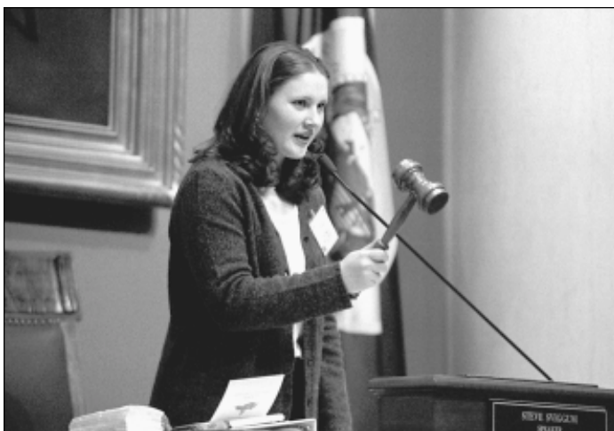
Tia Tilbury presides over the House of Representatives.