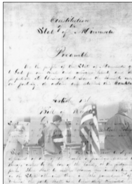
An 1898 amendment to the Minnesota Constitution made it more difficult to amend the constitution.

in November 1998 — one giving constitutional protection to hunting and fishing; one abolishing the state treasurer's office; and one extending state lottery proceeds to an environmental trust fund.