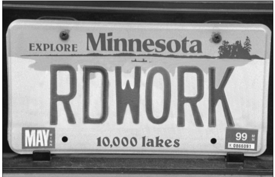
Lawmakers on House transportation committees are studying a number of plans to reduce license tab fees while maintaining funds for highway and transit projects statewide.

The current registration tax rate is $10 plus 1.25 percent of the vehicle's suggested retail price. However, when the vehicle is 3 years old, the percentage is dropped to 90 percent and is lowered consistently as the vehicle ages. When a vehicle is more than 10 years old, the motorist pays a flat fee of $35.