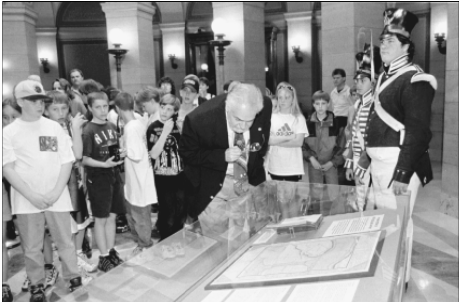
Students from Bloomington's Oak Grove School were among the first to get a glimpse of an 1823 hand-drawn map of what is now Fort Snelling. The map is a recent and significant acquisition by the Minnesota Historical Society displayed in the Capitol rotunda April 25.