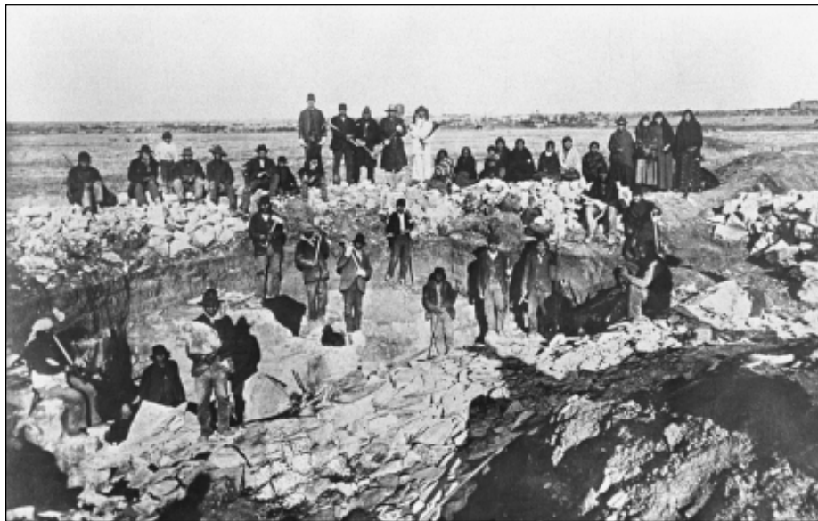
Indians at Pipestone Quarry in 1893.