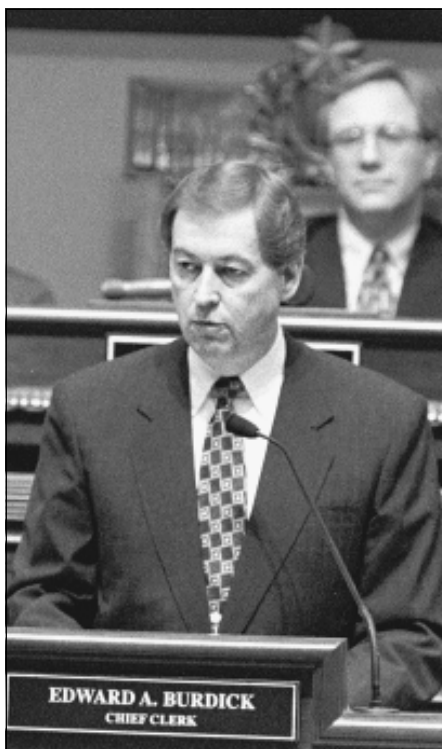
U.S. Sen. Rod Grams told lawmakers April 28 that the federal government should be a partner and not a dictator to the states.

Grams said that every area of responsibility currently held by the federal gov-