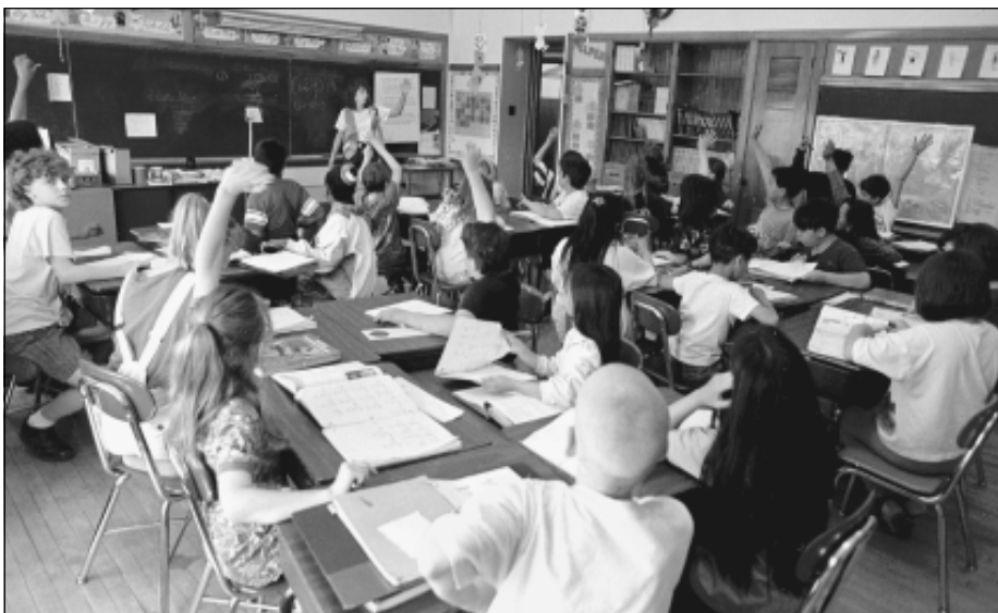
Students like these third graders from Jackson Elementary School in St. Paul soon may be required to take a statewide achievement test. A bill moving through the House would require uniform, statewide testing of third, fifth, and eighth graders beginning in the 1997-1998 school year and eleventh graders beginning no later than the 1999-2000 school year.

The move toward establishing a statewide testing system took a great leap forward early