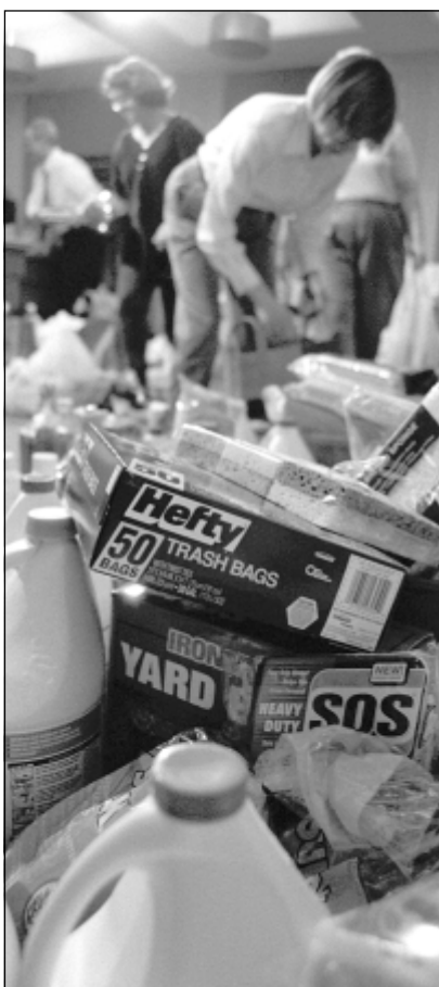
State staff, officials, and legislative lobbyists filled two trucks with cleaning and pet supplies for the victims of Minnesota's floods. They also raised $10,750 for the Red Cross and Salvation Army.