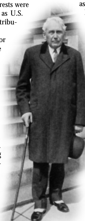
Frank B. Kellogg

Kellogg would live out his later years as an elder statesman, serving on the Permanent Court of International Justice (or World Court) and collecting awards and recognition. In 1928, Carleton College conferred upon him an honorary LL.D degree; in 1931, University of Minnesota echoed the gesture. Hamline University awarded him a DCL degree, also in 1931. That was in addition to honorary degrees from 12 other colleges and universities in the U.S. and around the world. Health problems forced him to resign from the court in 1935.