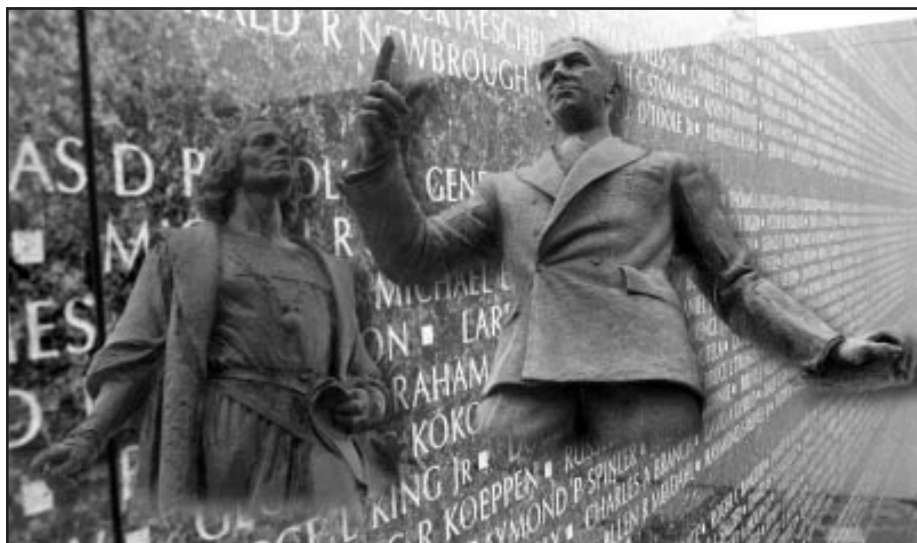
In addition to the overall design plan, Duroche said, the board also developed a policy for installing new commemorative works, both inside the Capitol building and

If you will be visiting the Capitol in the near future, call the Capitol Historic Site Program at (612) 296-2881 to schedule a tour.