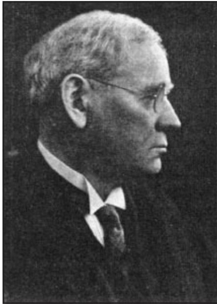
Pierce Butler, the first Minnesotan to win appointment to the nation's highest court.

By 1894, Butler was cited in the Minnesota Law Journal as "one of the best in the history of Ramsey County." The magazine said "he has no equal for his age as a criminal lawyer in the state," and "he has a charming and agreeable manner, is an eloquent speaker,