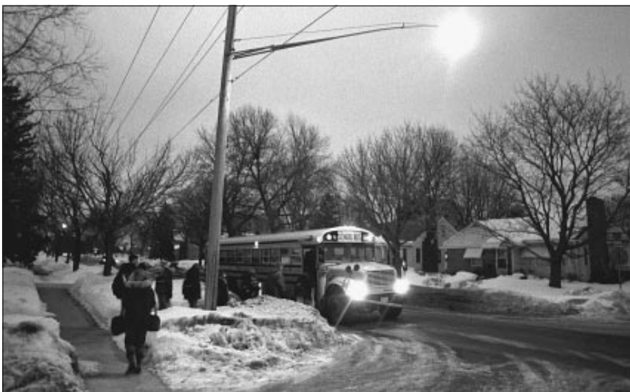
Early school start times means darkness when boarding the bus in the winter months for many students. Proponents of a bill to begin classes after 8 a.m. say that student safety in such circumstances is one reason the schedule change should be made.

The medical group reported that adolescents need more sleep — at least 9.5 hours per night — than do younger children or adults. At the same time, teenagers experience increasing demands on their time, including school, jobs, sports, homework, and socializing.