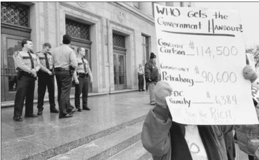
Welfare rights advocates marched away from the State Office Building after their entrance was barred March 25. Earlier in the day, five of the demonstrators were arrested after staging a protest in the office of House Speaker Phil Carruthers against changes in welfare benefits.