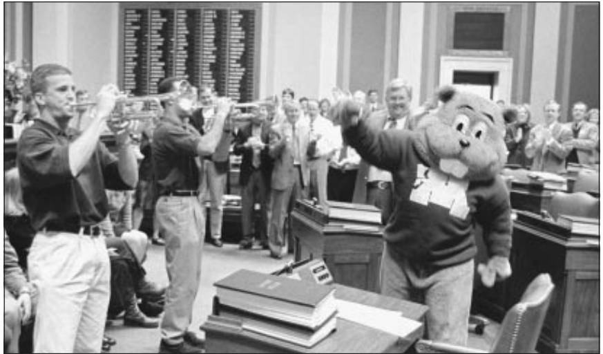
Goldie Gopher visited the House chamber March 26, prompting an enthusiastic outbreak of the Minnesota Rouser. The U of M's mascot and members of the pep band journeyed to the Capitol to drum up support for the Golden Gophers basketball team, playing this weekend in the Final Four.

vision is in keeping with an overall welfare reform bill moving through the Legislature. Cooperation would include providing information about the father, submitting to genetic tests, and appearing for interviews, hearings, and other legal proceedings.