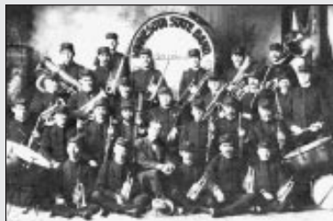
The state band in 1898

following the [John Philip] Souza format. Now we are the only one."