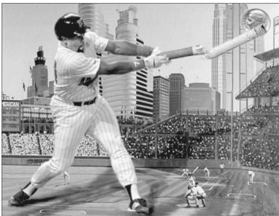
Before lawmakers could take a swing at voting on a 10-cent-per-pack cigarette tax increase to help pay for a new Twins outdoor baseball stadium, a bill heard March 13 replaced that tax with one on memorabilia and clothing bearing the logos of professional sports teams.

The proposal would replace the Minnesota Sports Facilities Commission with a statewide body to oversee construction of the new facility and the public's 49-percent interest in the Twins. The 11-member commission, appointed by the governor, would have a broad charge to negotiate with the Twins. By mutual agreement, the commission and the Twins would determine the size, amenities, and design of the stadium, as well as the selection of the architect and general contractor. The commission would be empowered to negotiate with the city of Minneapolis and Hennepin County to provide the necessary infrastructure for the fa-