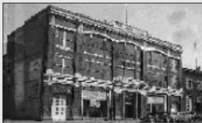
The Ford Building circa 1930.

The bookstore was established in 1957 to provide State of Minnesota agencies with a centralized service for the sale and