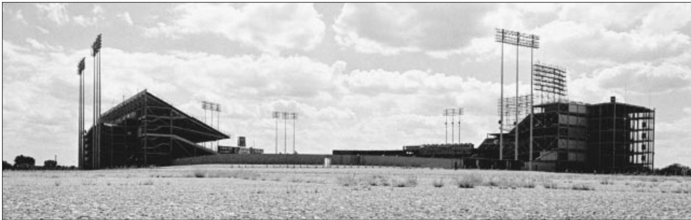
Throughout the 1960s and 1970s, both the Vikings and the Twins played in Bloomington's Metropolitan Stadium.

As the Legislature considers public funding for a new Minnesota Twins stadium, echoes of the debate that preceded the building of the Hubert H. Humphrey Metrodome are haunting the State Capitol. As Yogi Berra once said, "It's like déjà vu all over again."