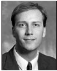
Rep. Marty Seifert

After waving in 16 parades in four months and hand-shaking at a pork feed, chicken feed, beef feed, and even a smelt feed, Marty