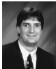
Rep. Torrey Westrom

The Capitol building isn't as big as it once was, at least in the eyes of one lawmaker. And legislators don't seem so "super human" anymore.