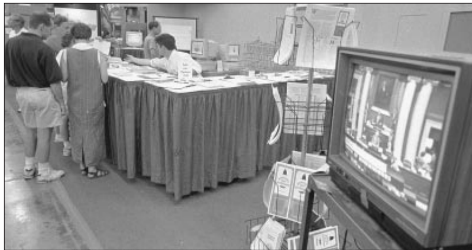
As part of the House's 23rd year at the Minnesota State Fair, computer, publications, and a video helped educate the public about the House of Representatives.

Horace Greeley, the acid-tongued publisher of the New York Tribune (and later Democratic presidential candidate), came west in 1865 to address the fair crowd. His