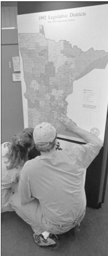
1996 fairgoers had the opportunity to look up their legislative district as part of the House Fair exhibit.

And since 1973, state House members have mixed with the public at an information booth in the Education Building. (The state Senate opened a similar booth in 1976.) Here, lawmakers have served as sounding boards and educators, listening to the questions and con-