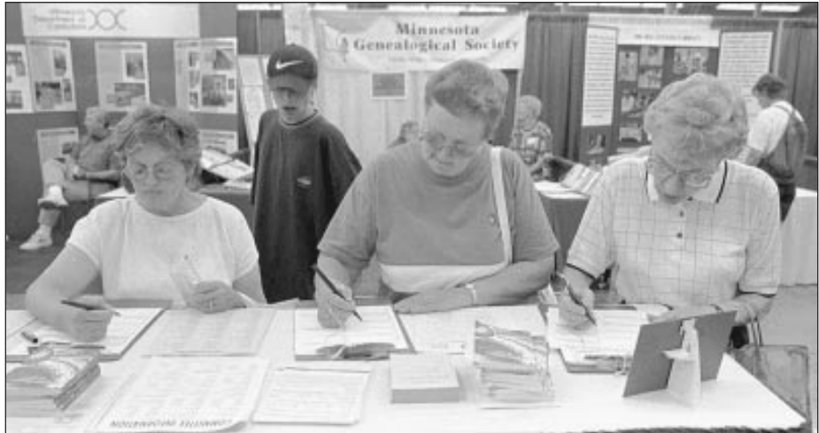
More than 6,500 Minnesotans visited the 1996 House State Fair exhibit Aug. 22 through Sept. 2, taking part in an unofficial state fair opinion poll. The results were distributed to the media and all lawmakers.

Yes ..... 38.1% ..... 2,494 No ..... 55.2% ..... 3,608 Other ..... 6.7% ..... 438