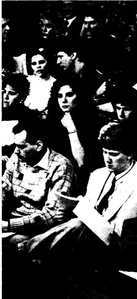
College students from around the state show their support for two education bills.

The committee recommended both bills to pass as amended. HF2146 now goes to the Appropriations Committee; HF1989 goes to the full House.