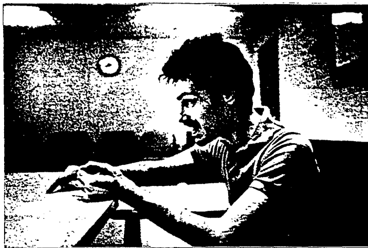
Karr: "This is the work of a curse. Or I'm in hell."

A person with schizophrenia lives somewhere between reality and a nightmare. Commonplace actions are sometimes invested with private meanings. Pull up a chair and a schizophrenic might take it as a sign that they are going to die. Scratch your ear, they might think it's time to go to sleep. Provost told Turnquist once that when people rub their noses it means he should "relax and enjoy the moment." Often schizophrenics have constructed elaborate paranoid fantasies about plots to kill, kidnap, or