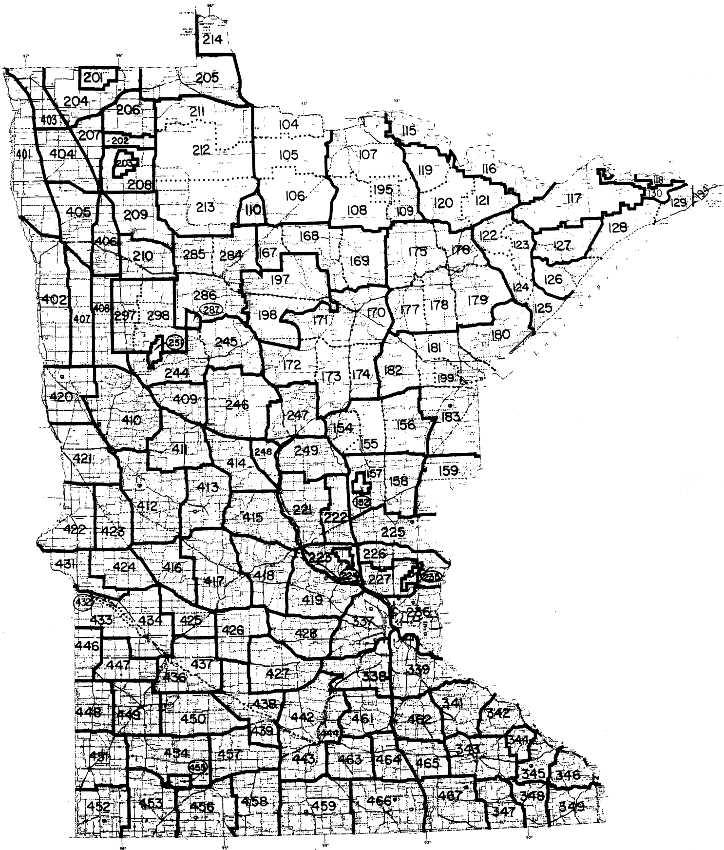
Figure 2. Bear Registration Blocks, 1989.