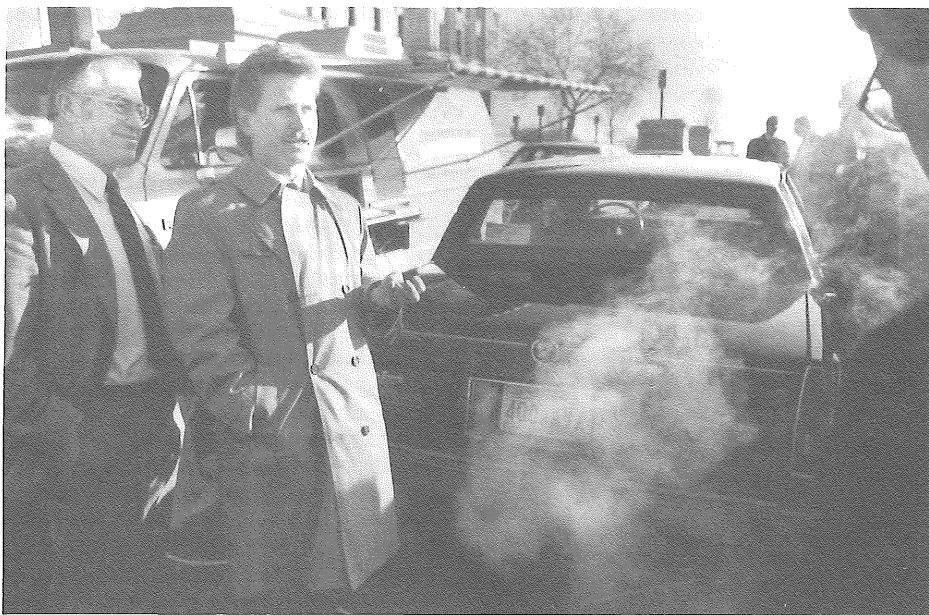
Sen. Clarence Purfeerst (left) watches as vehicle emission testing equipment is demonstrated. Chap. 661 mandates that metro area vehicles be tested beginning in 1991.