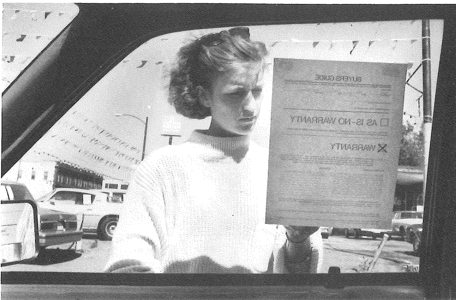
Consumers will have added protections under Chap. 634, the "Used car lemon law." The new law contains express warranty protections according to the age and mileage of the car.

A separate section of the law provides protections for dogs and cats. Beginning August 1, 1988, it is a petty misdemeanor to leave a dog or cat unattended in a motor vehicle under situations that may harm the animals' health. In periods of extreme heat or cold, or in other harmful situations, a police officer, humane agent, dog warden or fire or rescue department representative may enter the vehicle to remove the dog or cat. The violation is punishable with a $25 fine.