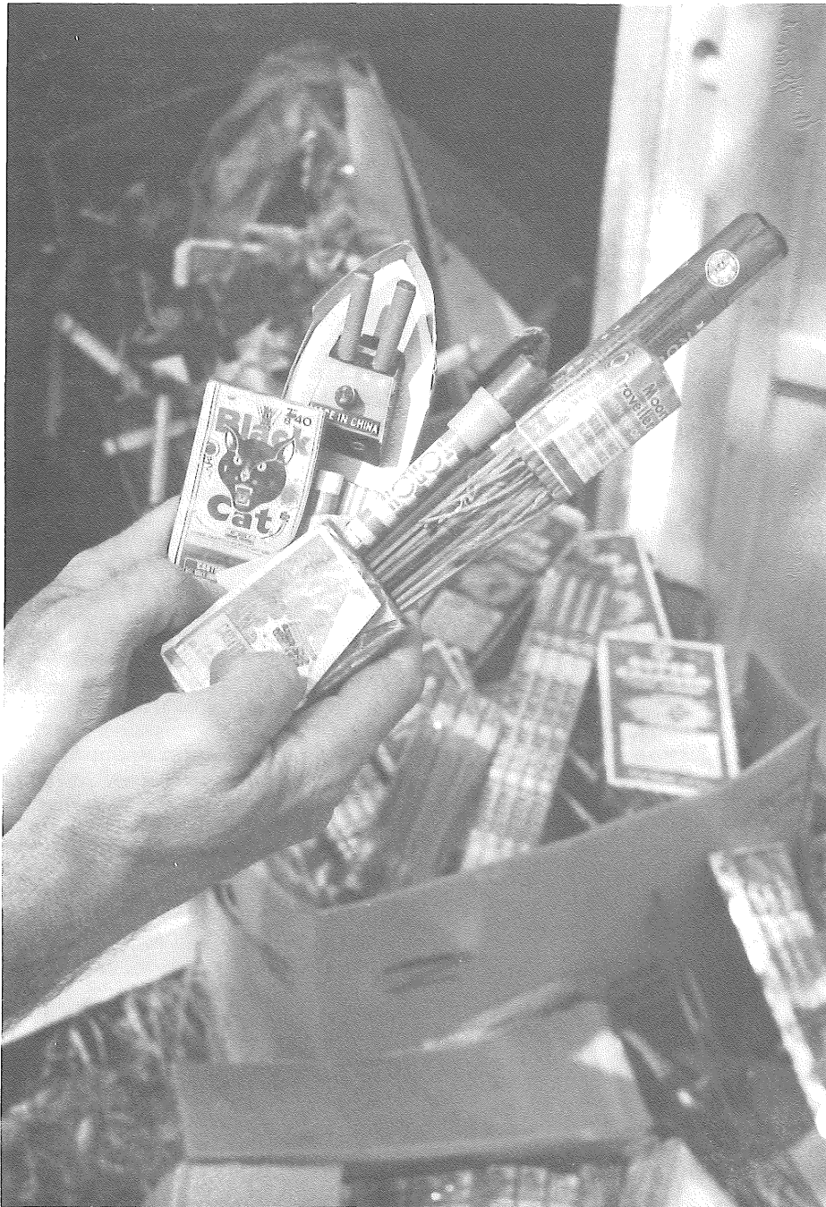
Possession as well as the sale and use of fireworks is outlawed under Chap. 584. These fireworks were confiscated by police and are being stored temporarily at the Twin Cities bomb disposal facility pending disposal by bomb squad personnel.

Possession, as well as the sale and use, of fireworks is now prohibited under a law enacted this session. Chapter 584, carried by Senator William Luther, also increases the penalties for the possession, sale or use of fireworks according to the quantity of fireworks involved. Under the new law, if the violation involves explosive fireworks in an amount of 35 pounds or more the sentence is imprisonment for not more than one year, or payment of a fine of not more than $3,000, or both. If the violation involves explosive fireworks in an amount of less than 35 pounds, the sentence is imprisonment for not more than 90 days, or payment of a fine of not more than $700, or both. Finally, if the violation involves any amount of fireworks that are not explosive fireworks the sentence is imprisonment for not more than 90 days, payment of a fine of not more than $700, or both. The new law does exempt holders of a federal explosives license or permit. One section of the new law also clarifies the crime of obstructing legal process or arrest.