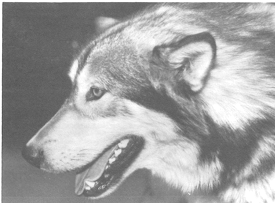
Chap. 686, the omnibus state departments appropriations law contains an appropriation of $150,000 for the review and site selection of the International Wolf Center.