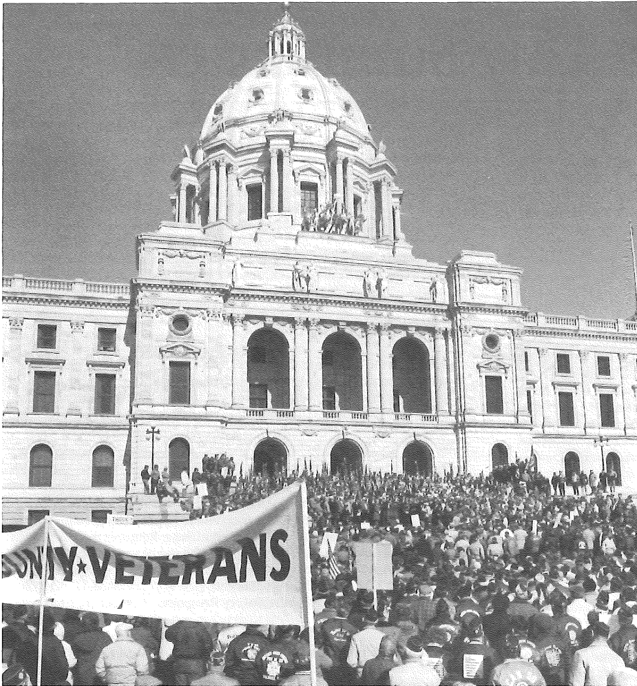
Thousands of veterans demonstrated February 18 on behalf of a proposal to return control of the state's veterans homes to the Department of Veterans Affairs. Chap. 699 transfers control back to the department and establishes a new board of directors to govern the homes.

the registration plate impoundment and submit a report containing findings and recommendations to the legislature by January 1, 1990.