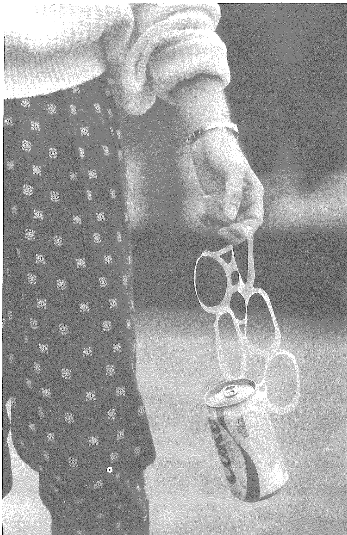
Chap. 685 specifies that nondegradable plastic ring connectors for food, beverages and motor oil will be prohibited after June 1, 1989.