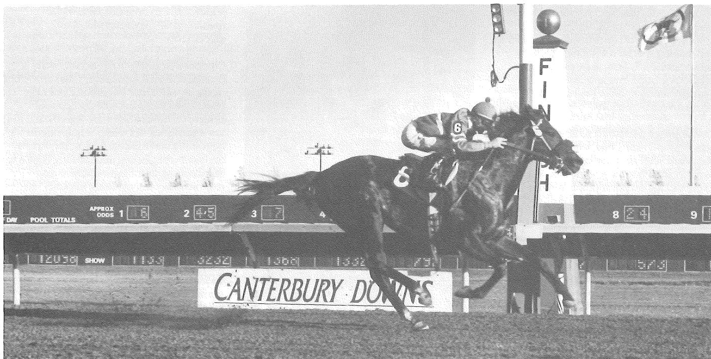
Chap. 696 contains a number of changes in the laws relating to parimutuel taxes. As a result, purses will be larger and taxes will be reduced for Canterbury Downs. Legislators believe that the changes will aid one of Minnesota's newest industries, horse racing.

for an indefinite period of time. The legislation contains an arbitration clause for the settlement of disputes.