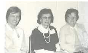
Family support group members discuss the "36 Hour Day" faced by caregivers of Alzheimer's patients.

The screening program provides assistance to nursing home applicants and their families by making professional assessments of each of the applicant's living situations, discussing the services available in the community, and when appropriate, preparing a plan of care. For people 65 years old and older, who are on Medical Assistance (MA) or would be on