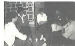
A teen-age support group and facilitator discuss their parent's affliction with Alzheimer's Disease and its effect on them.

"There is a great need for any help that can be made available to families, like respite care grants or any type of help that can be given because this disease causes a physical, emotional and a big financial burden on the families. Many families' life's savings are going to pay for the care of a loved one and leaving the caregiver to struggle through the 'golden years'."