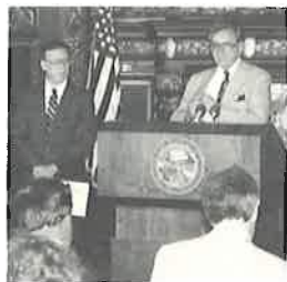
Left to right: Former Minnesota Department of Human Services Commissioner, Leonard Levine and Governor Rudy Perpich announcing the formation of the Alzheimer's Disease task force.

On July 10, 1986 Minnesota Governor Rudy Perpich announced formation of a task force on Alzheimer's Disease.