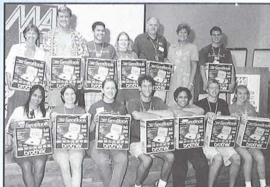
Each of the 1999 Governor's Scholars received a GeoBook from Brother to assist in planning their service projects.