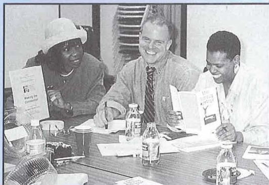
With support from Minnesota Mutual and Target, MAEF helped urban neighborhoods with booster clubs and fundraising to support academic activities.