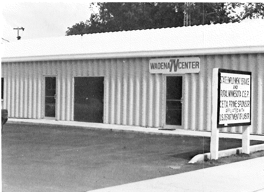
The new Wadena office is the only one which combines the operations of the State Employment Service and the Rural Minnesota Concentrated Employment Program.