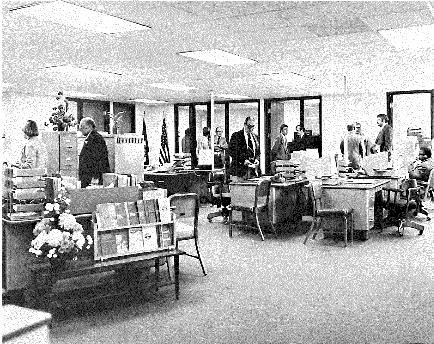
The new Moorhead office, opened July 1, 1977, was the first to be established in a former school building which is being converted into an office building for government and non-profit agencies.

This mobile office has a number of uses. It was the temporary office when a branch of the Mora office was established in Cambridge. It also is used for special projects such as the summer youth program, the apple harvest or other programs which require temporary office sites.