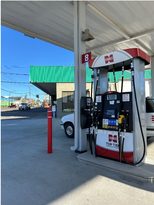
Photo 3. Bemidji Cooperative Association, located in Bemidji, now offers E15, E30, E50, and E85 at all four of their upgraded dispensers.

Bemidji Cooperative Association, located in Bemidji, was another recipient of a FY25 Biofuel Infrastructure Program Grant. They were awarded $196,174 for their project and despite tornados and severe flooding early in the summer, they completed their project July 2025. They report that the grant funding enabled them to upgrade their station, which would not have been financially possible otherwise. With a planned development in the nearby rail corridor, they expect this project will significantly benefit both the business and the community they serve. Since completing their project, they have already seen an increase in customers filling up at their station.