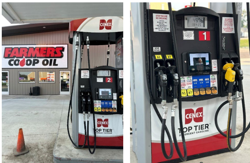
Photo 1 and Photo 2. Farmers Cooperative Oil, located in Elbow Lake, is the only retailer in their area to offer access to biofuels.

Farmers Cooperative Oil was formed in Elbow Lake in 1929. Their retail store offers a variety goods to their community including convenience foods, pet food, softener salt, liquefied petroleum tank filling, hardware fasteners, fishing and hunting licenses, full-service fueling, and are now the only station in the area to offer access to biofuels. Manager Derek Birdsall shares “We are feeling an excitement in our small farming community to offer ethanol blends. As the only provider in the close area, it’s a big deal. We would have had a difficult time funding the project without the grant.” Farmers Cooperative Oil received a grant award of $187,464 in FY25 and completed their project in summer of 2025. They are now able to offer E85, E30, and E20 at both of their two dispensers in all four fueling positions and report seeing an increase in traffic since completing their project.