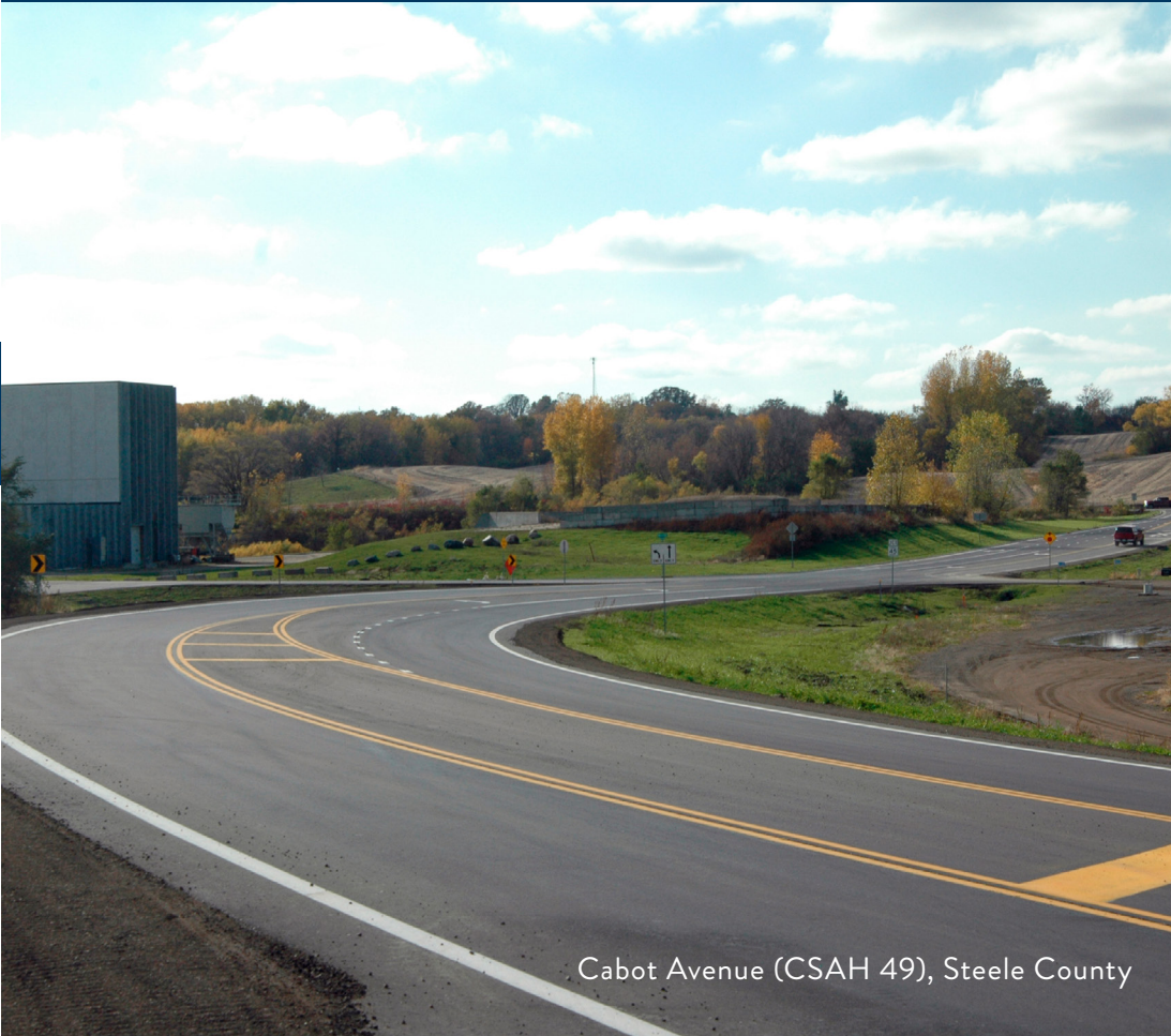
Cabot Avenue (CSAH 49), Steele County

Reported bridges are on state trunk highways, county roads, city streets, and township roads, and do not reflect number of bridges owned by each agency type.