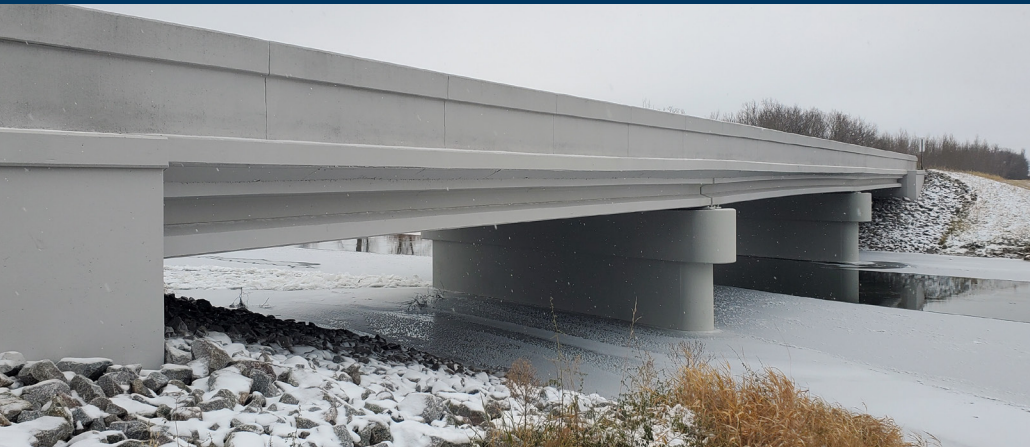
Bridge 57527, 250th Avenue over Red Lake River, Pennington County

Minnesota’s economic strength and vitality depends on an effective transportation system. To support the state’s system of streets, roads and bridges, the Minnesota Department of Transportation distributes funds for highway maintenance and construction to counties, cities and townships based on a formula determined by the legislature.