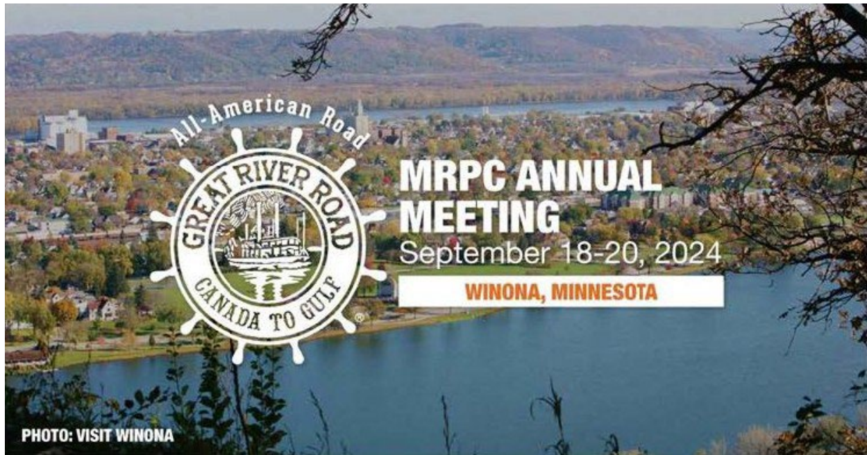
2024 MRPC Annual Meeting attendees at the Winona County History Center