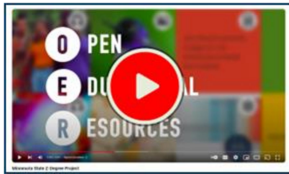
Watch the Z-Degree Video

More information about the student, faculty, and administration perspectives on Z-degrees can be viewed in the Minnesota State Z-degree project video .