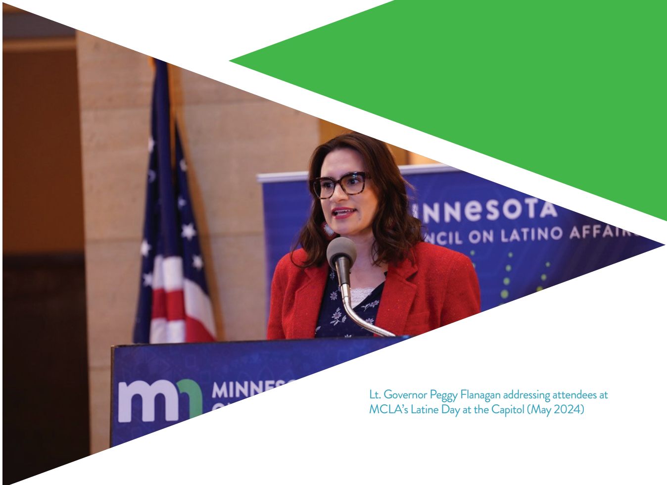
Lt. Governor Peggy Flanagan addressing attendees at MCLA's Latine Day at the Capitol (May 2024)

Thanks to this work, the legislative staff was instrumental in successfully securing investments in many programs to increase and retain the number of teachers of color, such as a one-time appropriation for the Aspiring Teachers of Color program. This advocacy was the perfect occasion to continue building a strong collaboration with the Ethnic Councils and the Coalition of Teachers of Color, a partnership that is now in its eight year. The Council also held numerous meetings with Latina hairdressers