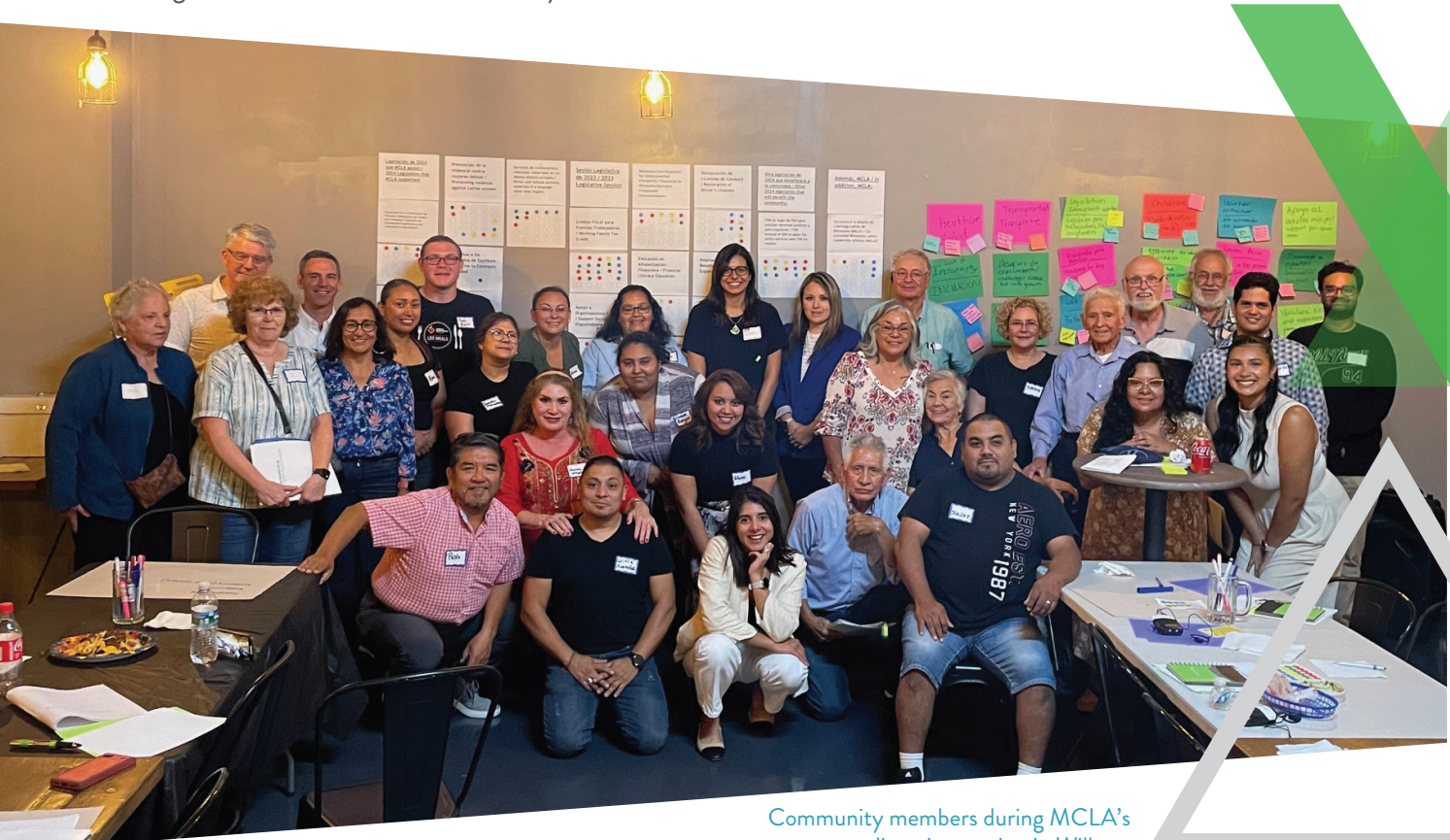
Community members during MCLA's listening session in Willmar

With that purpose, thanks to the work of our contracted Latina-owned firm, Light House Global (LHG), MCLA's staff planned and convened three listening sessions in Rochester, Willmar and Moorhead. The MCLA's staff also helped conduct a community priorities survey prepared by LHG that shed light in diverse topics and solutions and allowed us to understand the level of information that communities have regarding the passing of historic laws in 2023-2024. The policy recommendations included in the report " 2024 Community Priorities Analysis: Community Voices Illuminating our Path Forward " are geared towards improving the quality of life of Latino Minnesotans, eliminating systemic barriers in education and paths to financial stability, and ushering in reciprocity for the contributions they continue to make in our local economies and across the state.