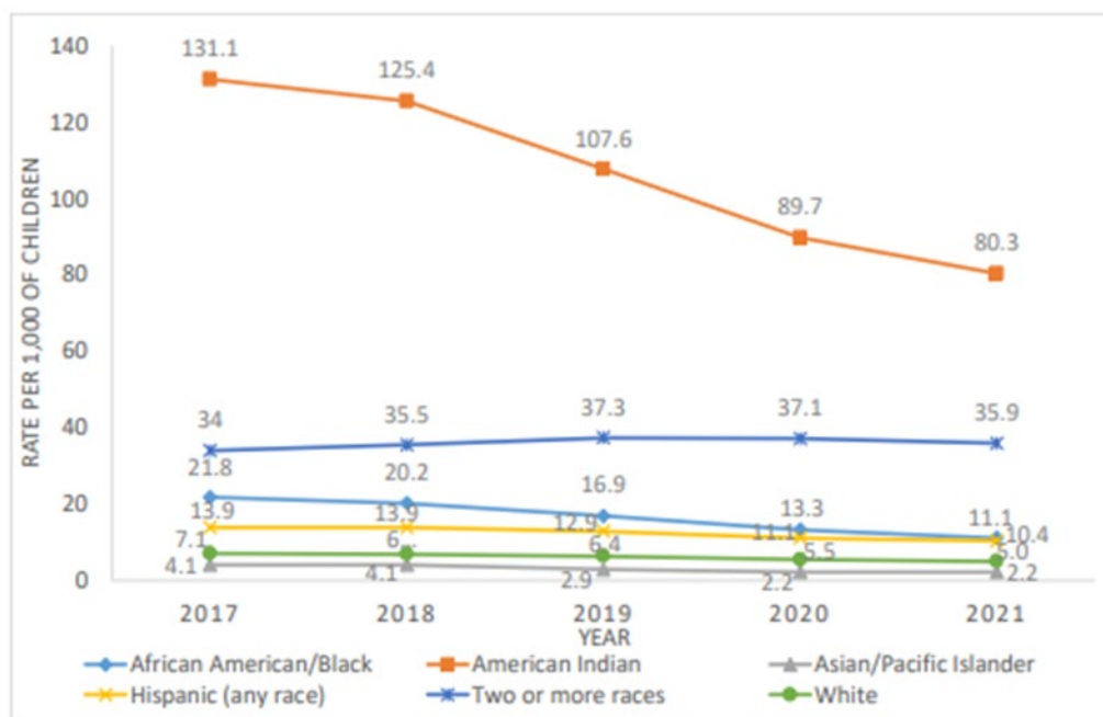
Figure 2. Five-year trend of the rate per 1,000 of children in out-of-home care by race/ethnicity, 2017 - 2021

[Note: Native children remain the most likely group in the state and nation for removal from their homes.]