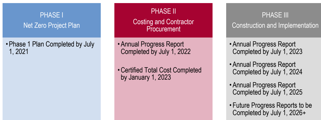
Figure 1. Prairie Island Net Zero Project – Three Phases