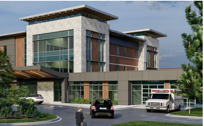
Mockup of the new Behavioral Health Facility at the Bethesda site, perspective view from Como Avenue (looking