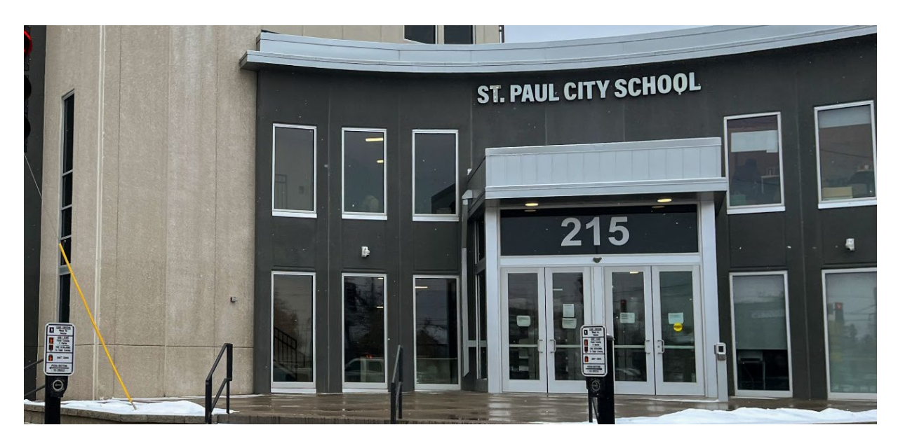
Photo of St. Paul City School along University Avenue. CAAPB worked closely with school leadership and architects on planning, design, and approval.