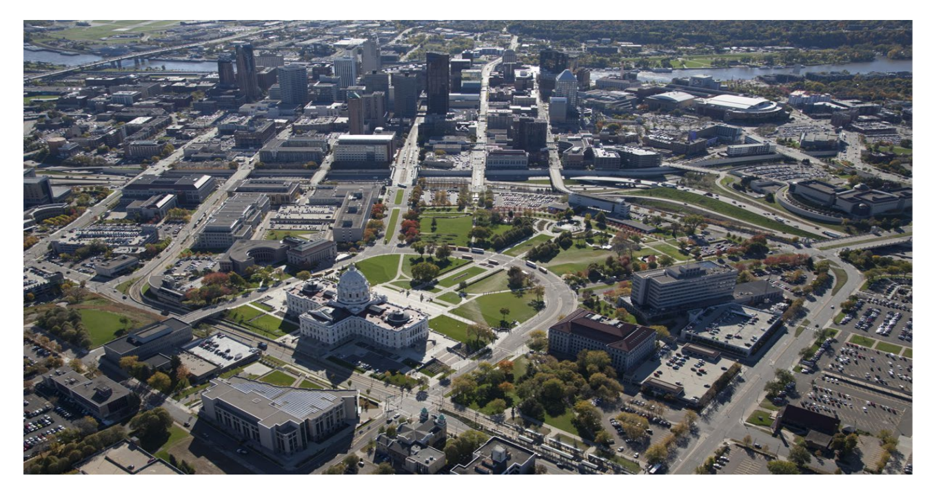
Aerial photo of the Minnesota Capitol campus looking south toward the Mississippi River, showing primary connections of Saint Peter Street, Wabasha Street, and Cedar Street.

The campus plan, as Cass Gilbert envisioned, was both practical and symbolic. The fan of streets, like spokes on a wheel with the Capitol at the center, provided a practical reconciliation of the city's two major street grid systems: the downtown streets aligned with the river and the burgeoning neighborhood streets set on a grid east/west and north/south. Gilbert's campus plan was also highly symbolic of the connection of state government to: