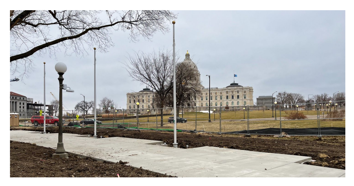
Photo showing construction of the Tribal Flag Plaza – the first segment in the implementation of the Commemorative Circle