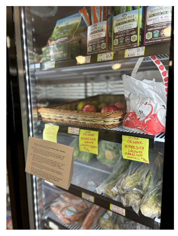
Photo 2. Pomme de Terre Foods, located in Morris, purchased and installed three coolers and a new freezer to increase energy efficiency and retail space in their store.