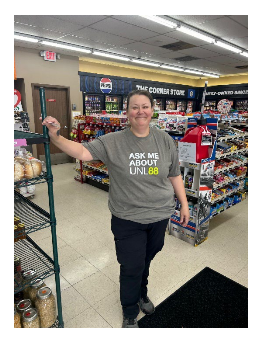
Photo 4. Employee of The Corner Store, wearing their new employee shirts promoting E15 (unleaded 88).