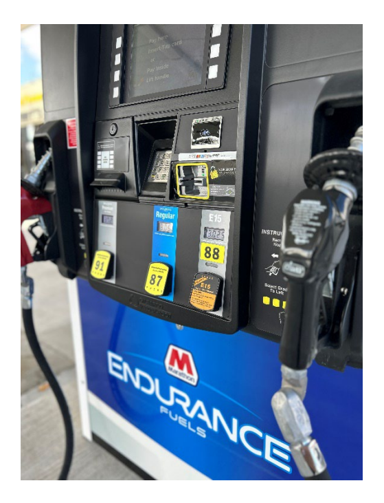
Photo 1 and Photo 2. Kenny's Tire and Auto Service, located in Bemidji, now offers access to biofuels at any of their station's four fueling dispensers.

The Corner Store, located in Inver Grove Heights, was another recipient of a FY24 Biofuel Infrastructure Program Grant. They were awarded $199,000 and completed their project in November 2024. They have been working with Growth Energy and the Minnesota Biofuels Association to offer marketing materials to customers to boost knowledge and sales of higher ethanol-blend fuels. For the first three weeks after their project completion, an owner or key employee staffed the pumps to greet fueling customers and explain the new fuels.