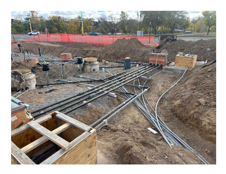
Photo 3. Photo taken during the construction of the new fueling equipment at The Corner Store, located in Inver Grove Heights.