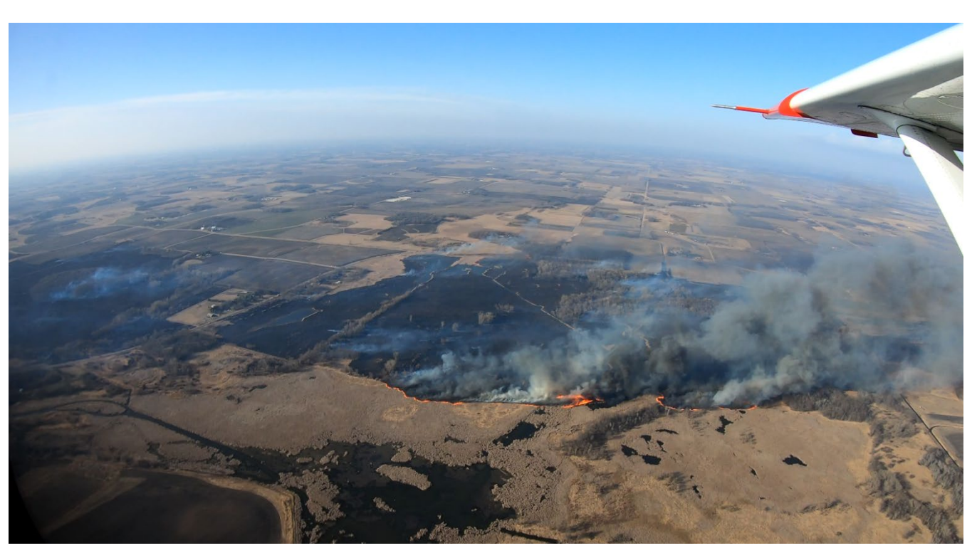
Figure 1: Snake Trail Fire, Waseca County, March 2024