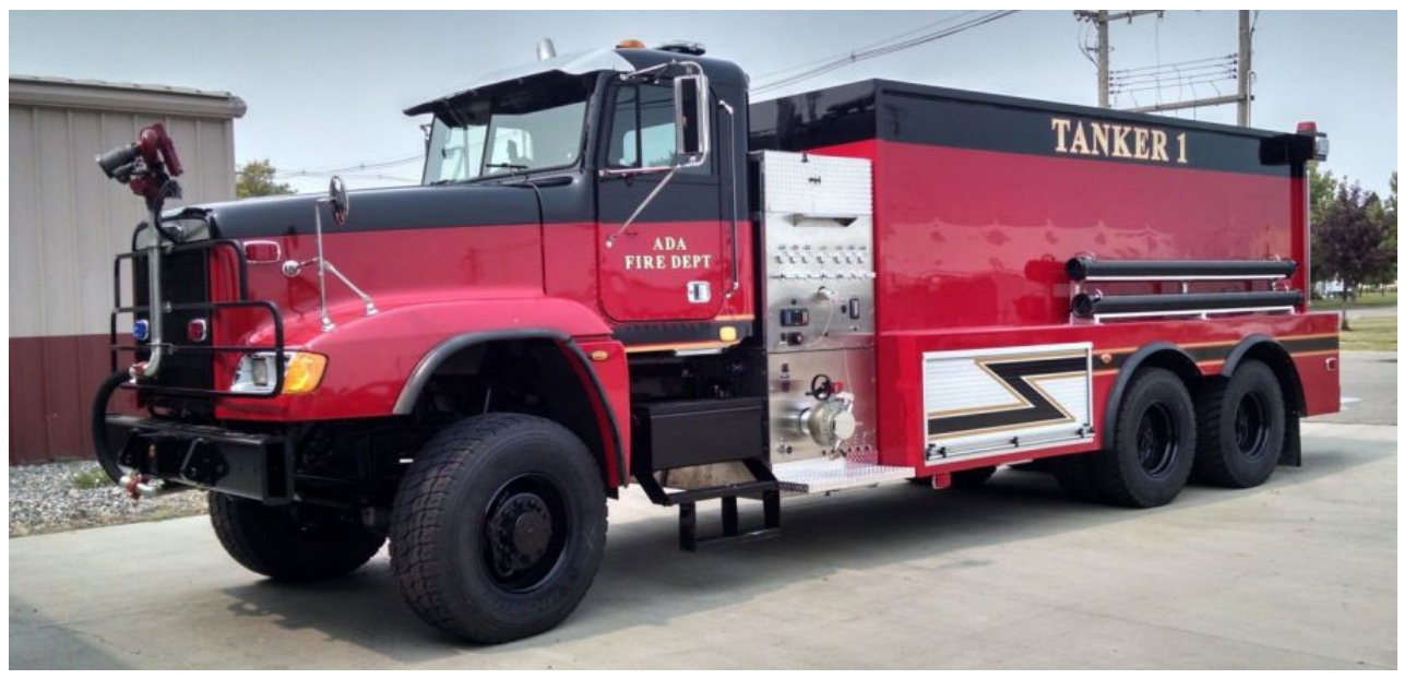
Figure 4: Refurbished federal excess property engine for the City of Ada.