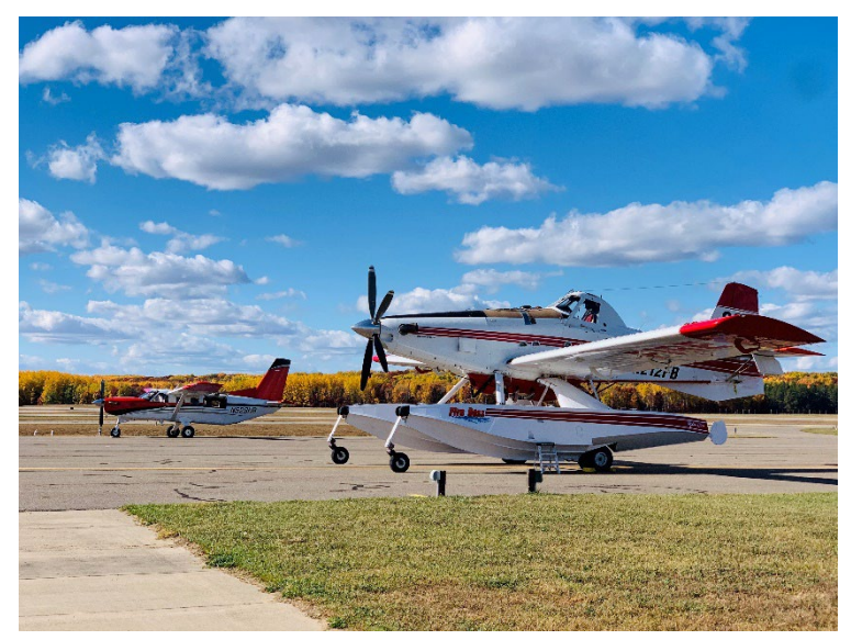
Figure 3: Fire Boss at Brainerd Air Tanker Base.

The DNR uses several types of aircraft to provide tactical aerial firefighting suppression and real time fire information to firefighters on the ground. In FY2024, the DNR filled 160 aircraft requests on 71 state-led wildfire responses. DNR-owned and contracted aircraft were also deployed to wildfires in other jurisdictions; the cost of those deployments is reimbursable.